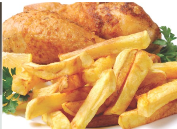
OUR RANGE IS PERFECT FOR ALL TAKE-AWAY FOODS