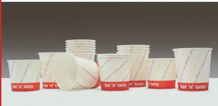
PAPER HOT CHIP CUPS