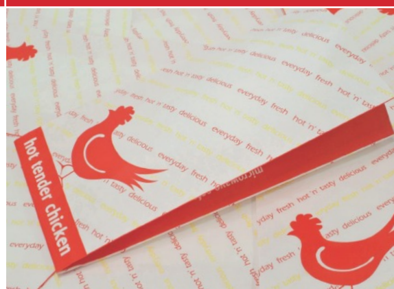
POLYLAMINATE HOT CHICKEN PAPER BAGS

Alfresco paper chip cups and hot chicken bags are available in a fresh and striking design to deliver a consistent and upmarket look for a broad range of take-away foods.